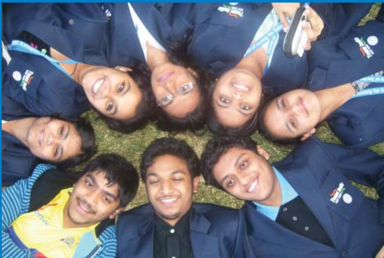
Participants at Intel ISEF 2009